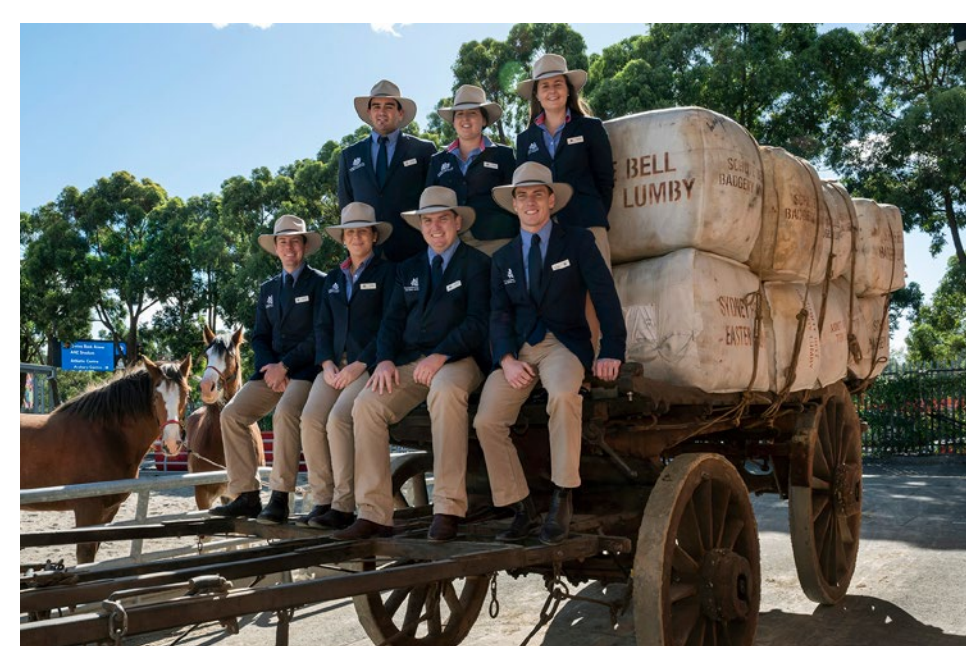
2021 RAS Rural Achiever Award recipients

Akubra was once again proud to support The Land Showgirl Competition and the RAS Rural Achiever Award – a state-wide leadership program run by the Royal Agricultural Society of NSW to recognise future young leaders