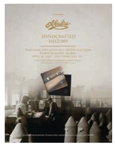
Country Style Magazine and Qantaslink Magazine

This season we've featured in the following high profile magazines and online publications: