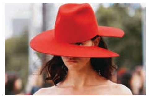
Akubra hats in shades of black, blue and tomato sauce red