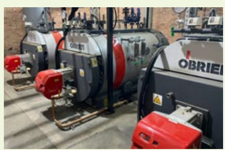
The factory's new gas-fired boilers

At Akubra, we understand that our actions today will impact the environment of tomorrow. We know that our customers are as engaged with saving the planet as we are.