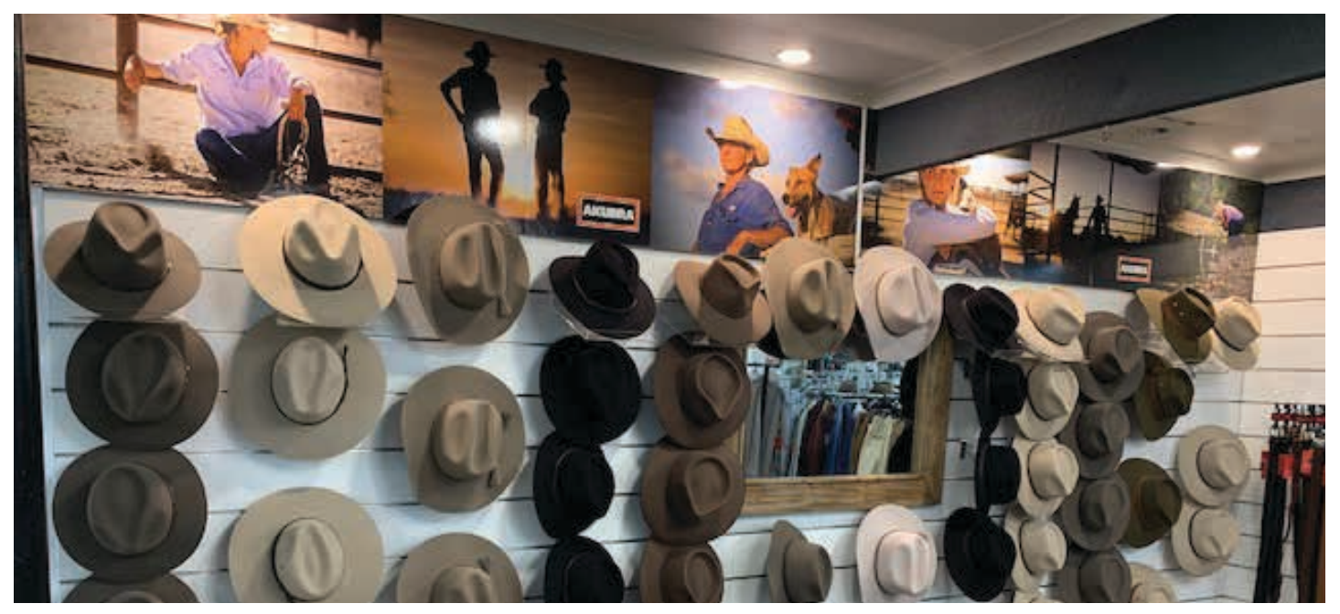
The new display at Hastings Co-op Department Store, Wauchope

The iconic Akubra brand is proudly on display at the Hastings Co-op Department Store in the regional NSW town of Wauchope, not far down the road from the Akubra factory in Kempsey.