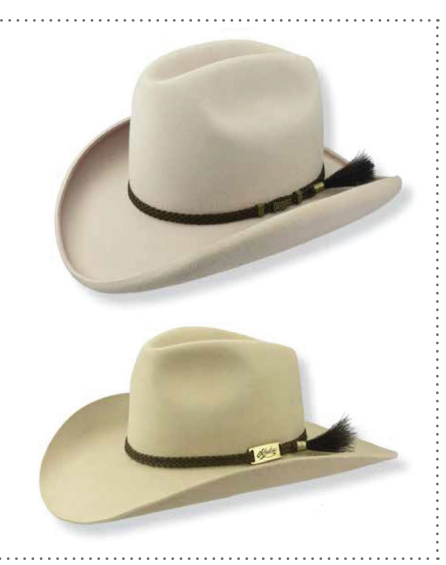
NEW PRODUCTS: Kentucky Rancher (top) and Mansfield High Country (bottom)

Featuring our most popular winged brim shape, the Mansfield provides both sun protection in the High Country and style at the local B&S. The Mansfield High Country is available in Sand and Sorrel Tan on indent only.